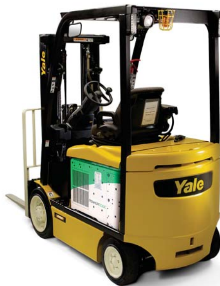
Yale® truck with Nuvera® Power Edge®

This white paper examines the adoption of hydrogen fuel cell-powered lift trucks, the availability of hydrogen and the benefits and best-suited applications for this impressive technology