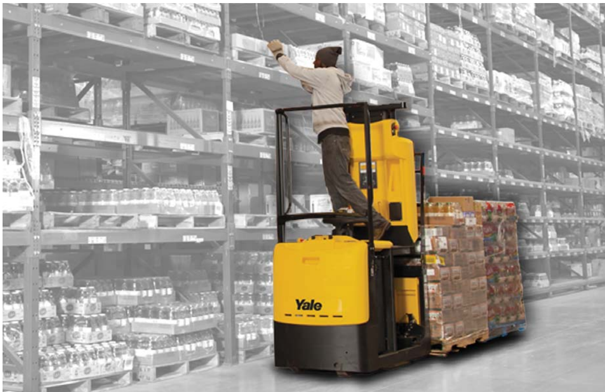
Yale® MO25 multi-level order selector with optional features.

This white paper discusses how an innovative multi-level lift truck design can expand the “golden zone” of the pick face, enabling new slotting strategies that increase capacity and picking efficiency, reduce labor and storage requirements and decrease overall materials handling costs.